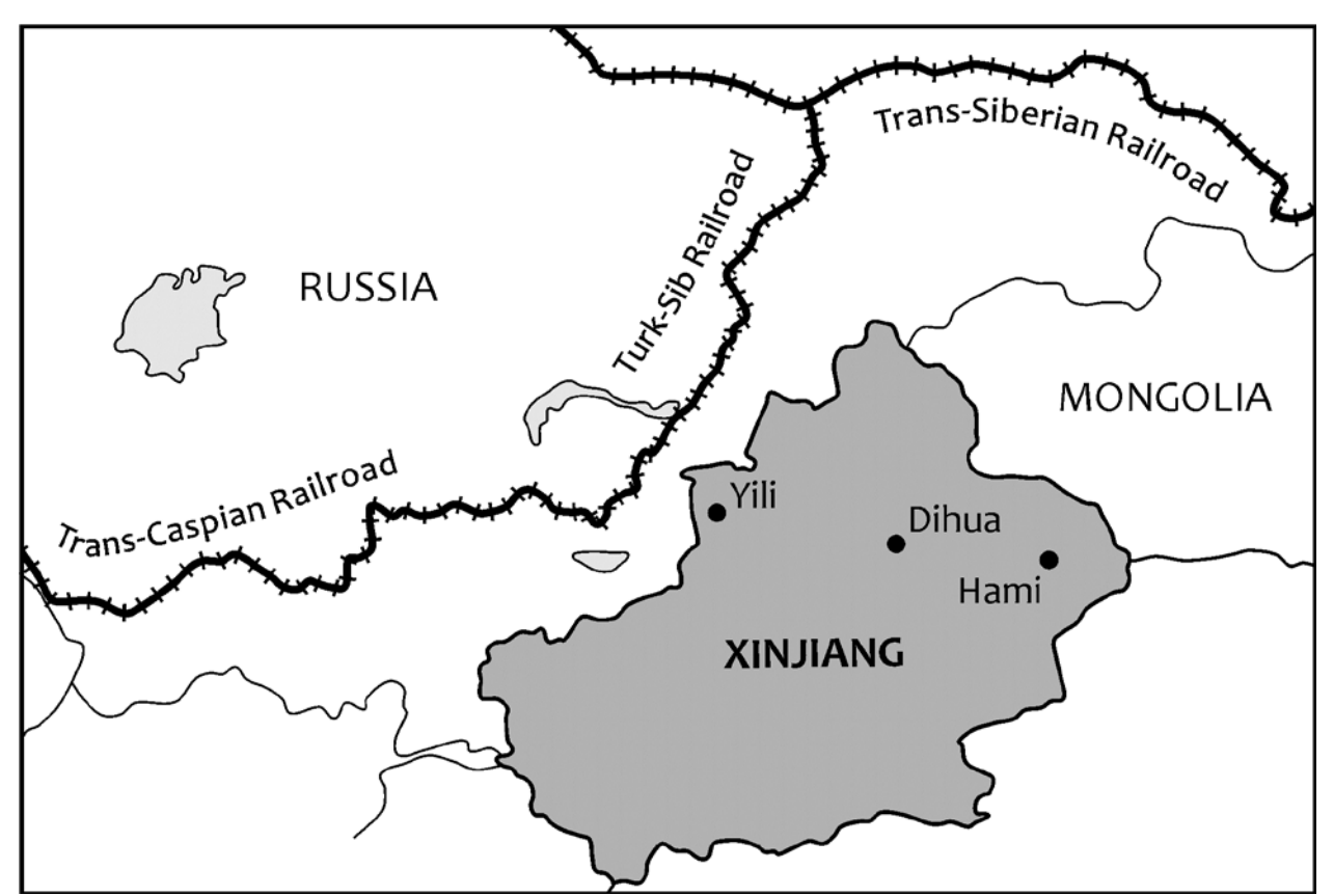
Map 2: Soviet Rail Network after 1928 (Cartography: Debbie Newell)

In stark contrast to central government officials in Nanjing and Chongqing, who proved largely unwilling to do more than pay lip service to the development of a road or rail network, foreign powers and the Russian empire and Soviet Union in particular, played a much more forward role in shaping the region's transport infrastructure. Following the expansion of their empire into Central Asia in the 1860s, Russian officials and merchants began to hear rumors about Xinjiang's lucrative resource wealth, from stories about gold nuggets dug out of river banks that were the size of a horse's hoof to reports about places in Xinjiang's arid northern steppe where raw petroleum bubbled out of the ground. The rumors prompted an outflow of Russian explorers, travelers, and geologists to Xinjiang in the latter half of the 19th century, and helped spawn an enduring interest in the region's resources, whether it was gold, furs, petroleum, or rare earth minerals.